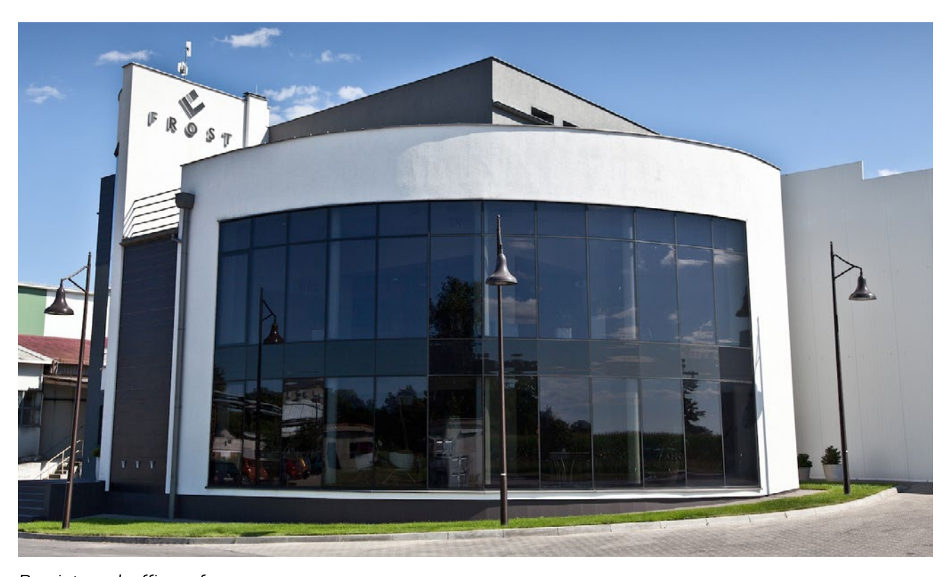
Registered office of the FROST company