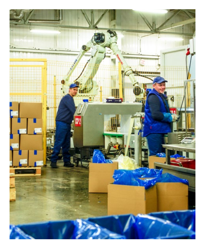
Employees of the FROST company

"Palletisation of products at Frost was a demanding project due to the large variety of packaging (various sized cartons and frosted bags) and pallets of different dimensions. Drewmax designed and manufactured a gripper using pneumatic vacuum generators and peripheral equipment to transport packages and pallets. The Kawasaki ZX130L robot was used in this project. Thanks to the functionality of the AS programming language used in Kawasaki robots, it was possible to build a flexible and very clear application, allowing the placement of basically any packaging in any configuration on any pallet. This application also made use of the possibility of creating a user interface on the robot teach pendants, thanks to which the application was equipped with a simple interface for modifying